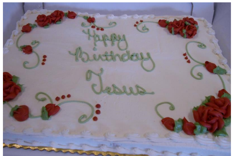
"Happy Birthday Jesus" Cake