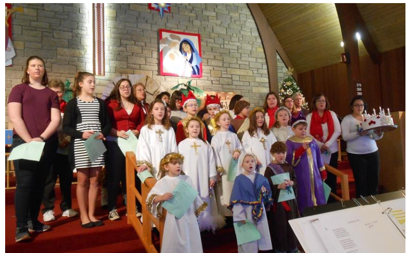
Sunday School singing "Happy Birthday, Jesus"