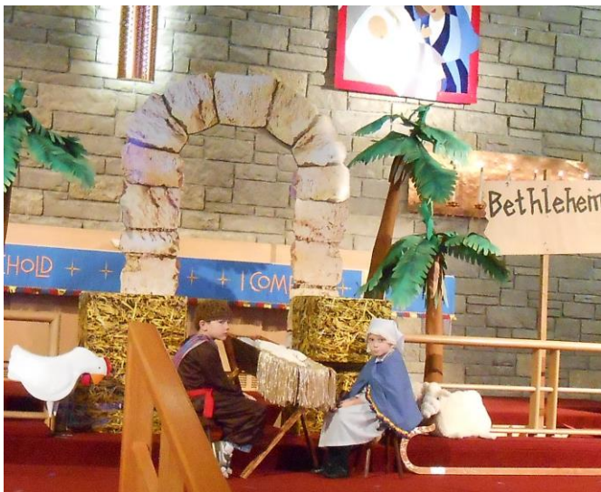
Jesus was born, and they lay him in a manger because there was no room at the Inn.