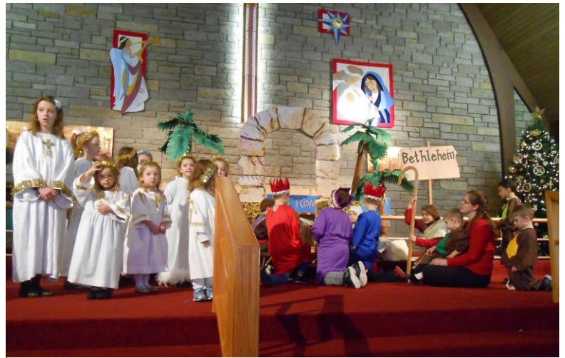
The Wisemen bring their gifts to Jesus